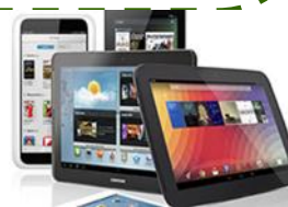
The Gauteng department of education envisions a future of paperless classrooms.

The deadline for the completion of the renovations to the classrooms, mainly in schools in townships and rural areas, is the end of August.