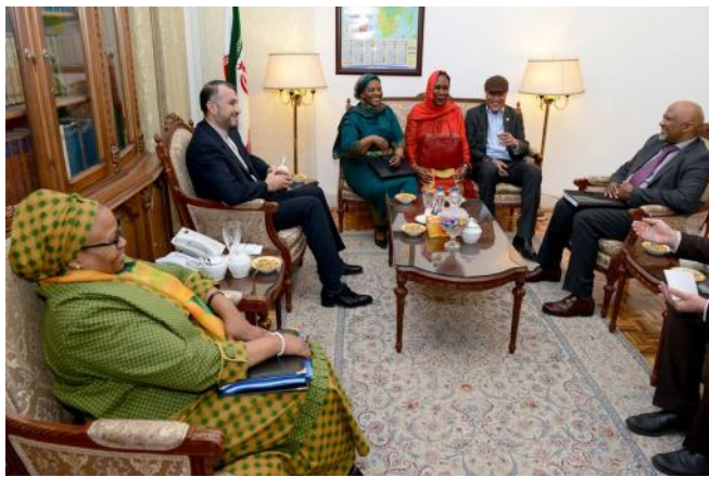
The South African Deputy Ministers of International Relation and Cooperation, Energy and Finance with Deputy Foreign Minister Amir Abdollahian on August 30, 2015.