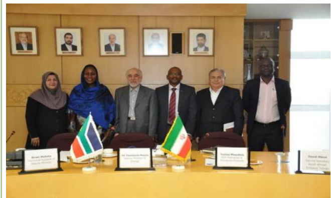
Deputy Energy Minister Majola also had a meeting with Deputy Oil Minister and President of the National Petrochemical Company, Mr. Sha'ri Moghadam.